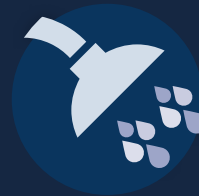
Appliances and pipes last longer