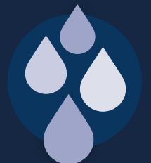
Less scale buildup, stains, or soap residue

UP TO 20% YEARLY SAVINGS ON WATER HEATING